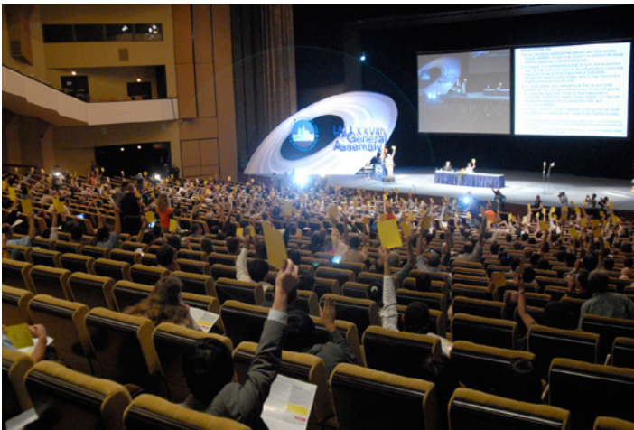
Astronomers at the 2006 meeting of the International Astronomical Union voting on resolution 5A, the first formal definition of a planet.

compels many students to complete unassigned and ungraded “homework” is clearly some indicator of intellectual engagement.