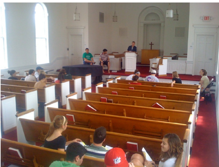
Elon University students playing The Trial of Galileo game. To add a sense of liminality, most Reacting to the Past games include a historical ritual or prop. In this case, a meeting of the cardinals of the Holy Office was held at the campus chapel.