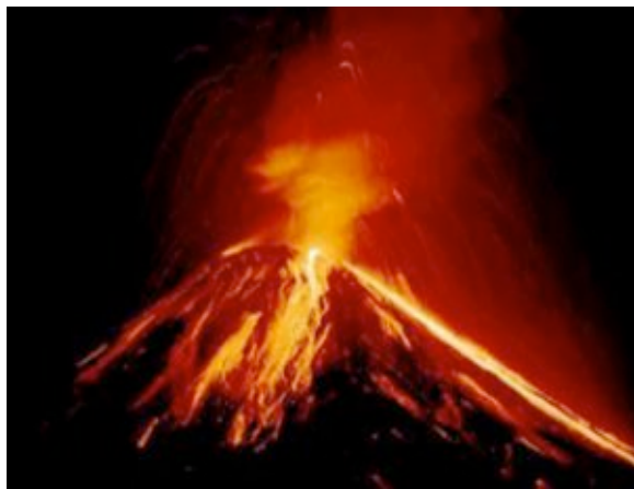
Figure 4: Powerful images, such as this one, can be used for persuasive storytelling [17]. Unique and powerful images are best for evoking emotion.