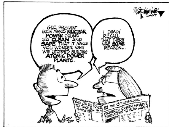
Figure 1: This comic was used as an attention grabber [4]. Comic situations can often add to the story.

For many students, visuals offer a different mode of conveying information. It is worth noting the different roles that images can play. Figures 1-4 are samples from student work.